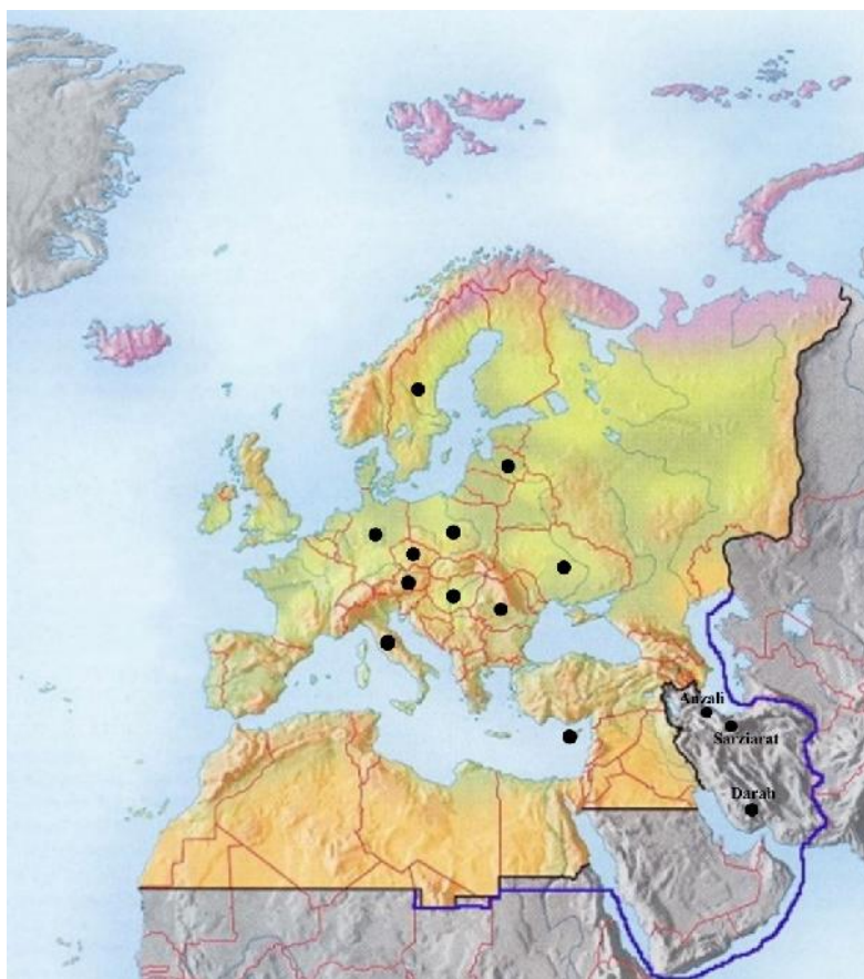
Fig. 2. Known distribution of Gelis declivis in the western Palearctic. Countries from which G. declivis is known are marked with a dot, but Iranian records are marked more precisely.

The results show that G. declivis could be adapted to different climate conditions. Bandar-e-Anzali is located at the south of the Caspian Sea and the northern slopes of the Alborz Mountains. This region has the most humid climate of any regions in Iran. The average 50-year rainfall, average annual relative humidity and average annual temperature of Bandar-e-Anzali are 1850 mm, 84% and 16.2°C, respectively. Such climate conditions caused the creation of a unique and one of the most diverse biomes in the world which is known as the Hyrcanian forests. The village of Sarziarat in the province of Alborz is located at the southern slopes of the central Alborz Mountain range. Sarziarat has an alpine climate with cold and long winters. On the other hand, Darab County in the south of the province of Fars is climatologically a temperate region with an average annual rainfall of about 350 mm. The altitude of these three localities varies from 22 m a.s.l. in Bandar-Anzali to 1987 m a.s.l. in Sarziarat.