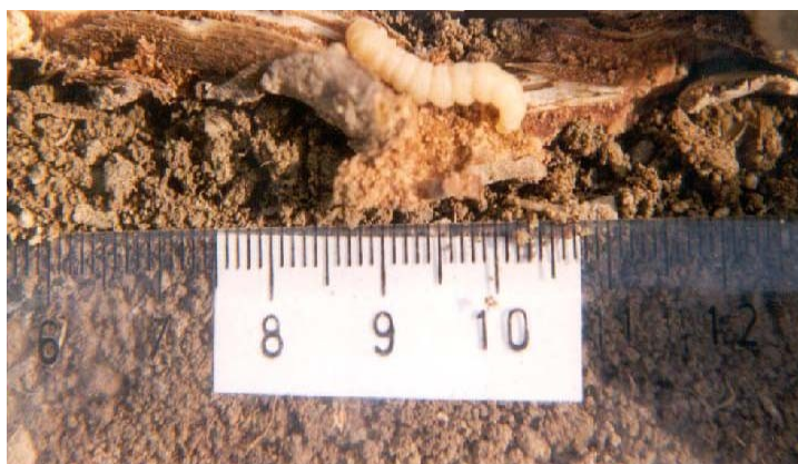
Figure 3. Last instar larva of C. schizoceriformis .