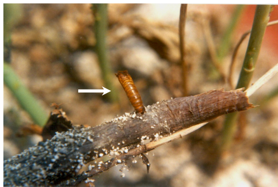
Figure 1. The chrysalid skin of C. schizoceriformis (arrowed) dragged outside of the stem.