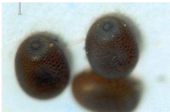
Figure 2. Eggs of C. schizoceriformis showing a network of slightly raised veins.