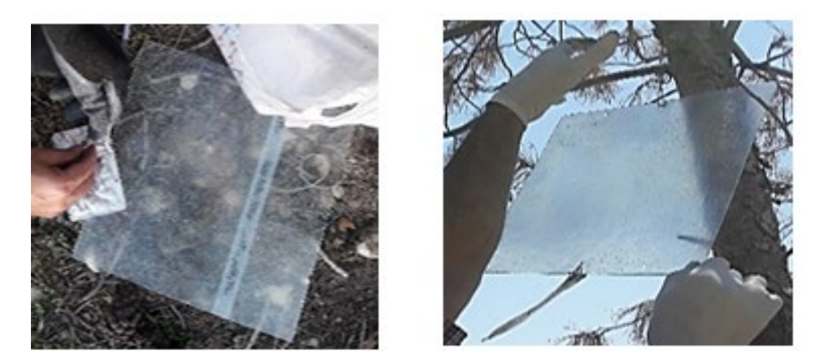
Fig.1. Trap made of transparent plate and hanged ECONEX ORTHOTOMICUS EROSUS 60 DAYS pheromone

A recent significant increase in the population of O. erosus has led to great concern in pine forests (Pernek et al. , 2019). Based on research, the geographical factors (latitude, elevation and etc.) as well as climatic conditions and host tree availability, would affect the flight activity period and population density of O. erosus (Logan & Powell, 2001; Fettig et al. , 2007; Lee et al. , 2008; Pernek et al. , 2019; Zabihi et al. , 2021). So that the findings on population fluctuations of O. erosus could be helpful to better understand the biodiversity of the pest.