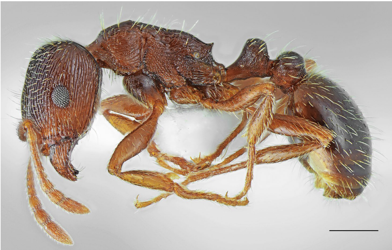
Fig. 3. Tetramorium staerckei Kratochvíl, 1944 (worker) lateral view of the body (scale bar = 0.5 mm).