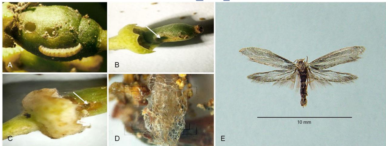
Figure 1. Last larval instar (A), damages caused by the larvae (B, C), pupa inside cocoon (D), and the adult male of Prays citri (Millière), upperside. Arrows in the figures B and C indicate the damages caused by the larvae on sepals of the Citrus flower in the greenhouse in Sari region, Mazandaran, Iran. (A, after CABI, 2024; B–E, original; photos: B–D, Mohammad Reza Damavandian, E, Helen Alipanah).

Male, female similar externally, female somewhat lighter. Forewing length 5.2–6.2 mm; wingspan 11.5–14.6 mm. Forewing greyish-brown, strongly mottled by spots, costal margin with few ill-defined blackish brown strigulae alternated with whitish-grey on basal half; fringes greyish-brown. Hindwing brownish-grey, fringes concolorous (Fig. 1E) (Tamutis et al. , 2022; Grout & Moore, 2024). There was no external variation among the studied material.