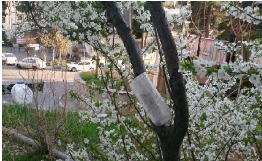
Fig. 2 – A bottle trap, installed in Taleghani Hospital ground, Tehran, Iran (original photo).

Net collection was done for about one hour in each hospital ground at each collecting interval. A biweekly schedule was approved for sampling from March 2020 to February 2021. The collected adult samples were identified after pinning. The humidifying process was done for the case of dried samples for pulling out the genital organs in some samples such as Sarcophagidae. Some of the collected larvae were reared temporarily to have their adult for confirming their adult fly's identifications. The flies were identified by relevant keys (James 1947; Zumpt 1965; Povolny & Verves 1997; Akbarzadeh et al 2015).