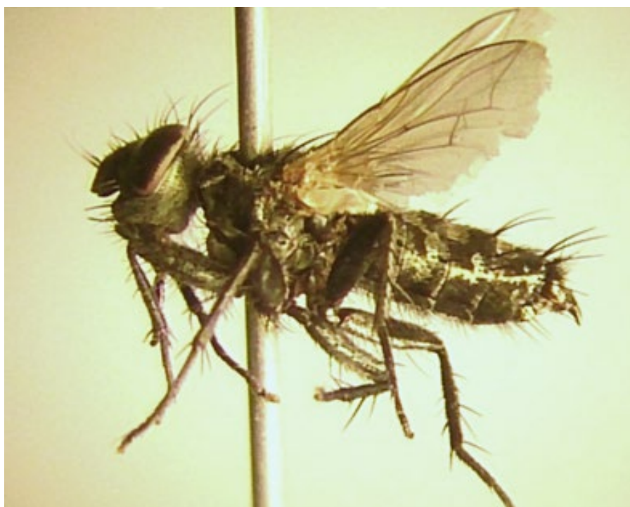
Fig. 3 – Sarcophaga nigriventris Meigen, 1826 (Diptera: Sarcophagidae), collected in hospital grounds of Tehran, Iran (original photo).